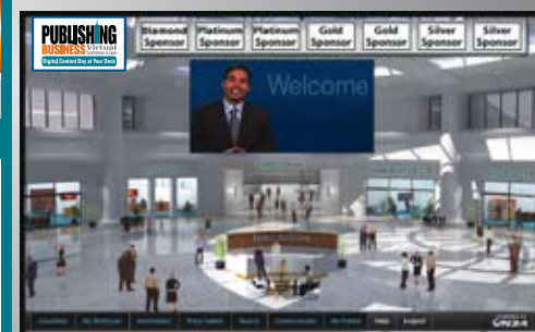
The Virtual Plaza