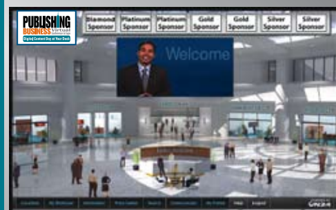
The Virtual Plaza